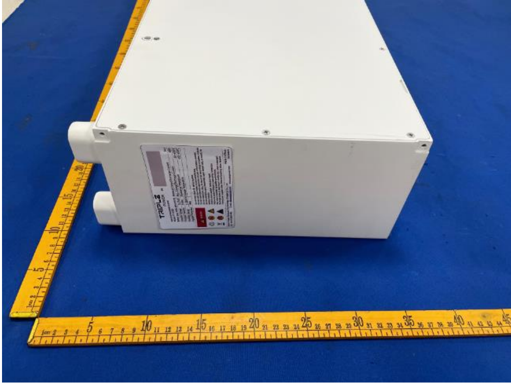
样品图片 (Sample photograph) -4