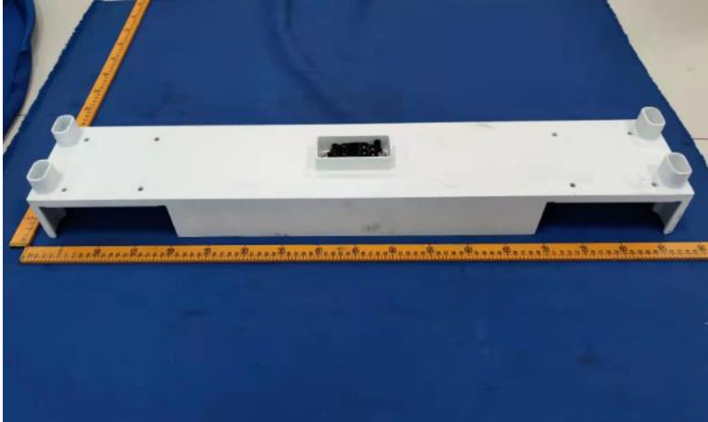
连接底座图片 (Connecting base photograph) -9