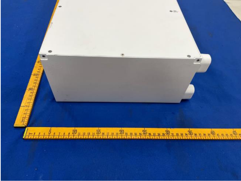
样品图片 (Sample photograph) -6