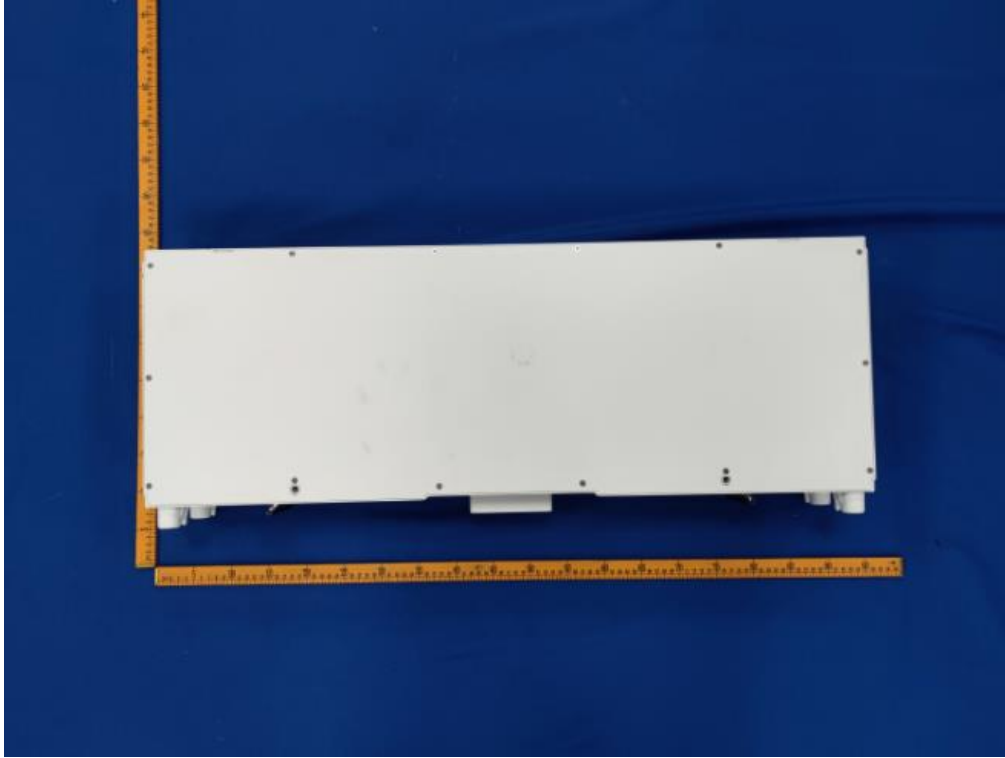
样品图片 (Sample photograph) -2